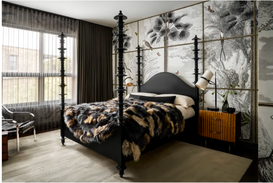
The bedroom after the renovation

(Image credit: Photography Credit: Ryan McDonald / Stylist Credit: Kimberly Swedelius)