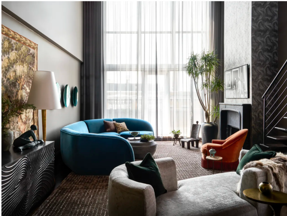
The living room after the renovation

It's almost hard to imagine the space as plain as it once was, with its now plush curved couch and eye-catching fringed orange sofa chair. The unexpected pops of color are a welcome surprise in contrast to the darker neutrals that coat the room.