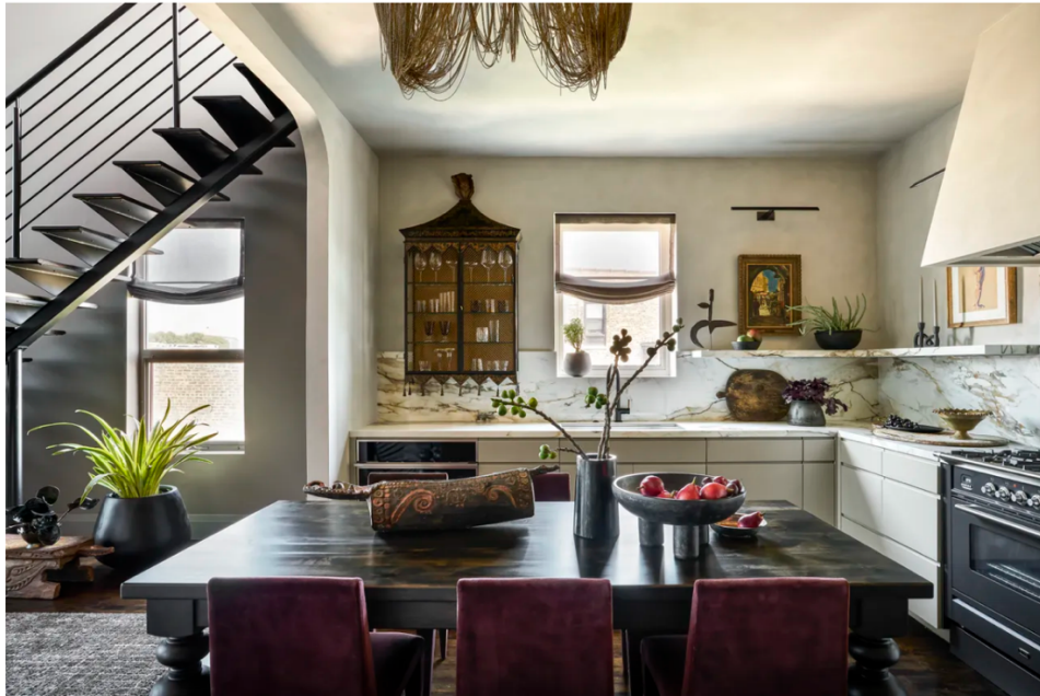
The kitchen after the renovation

Lauren tells us that the dining room and the kitchen were designed to be the focal point of the home in order to improve the overall flow of the space while also prioritizing the intimacy of the interiors. The previously standard peninsula kitchen and open dining space were renovated to create a romanticized expanse fit for entertaining.