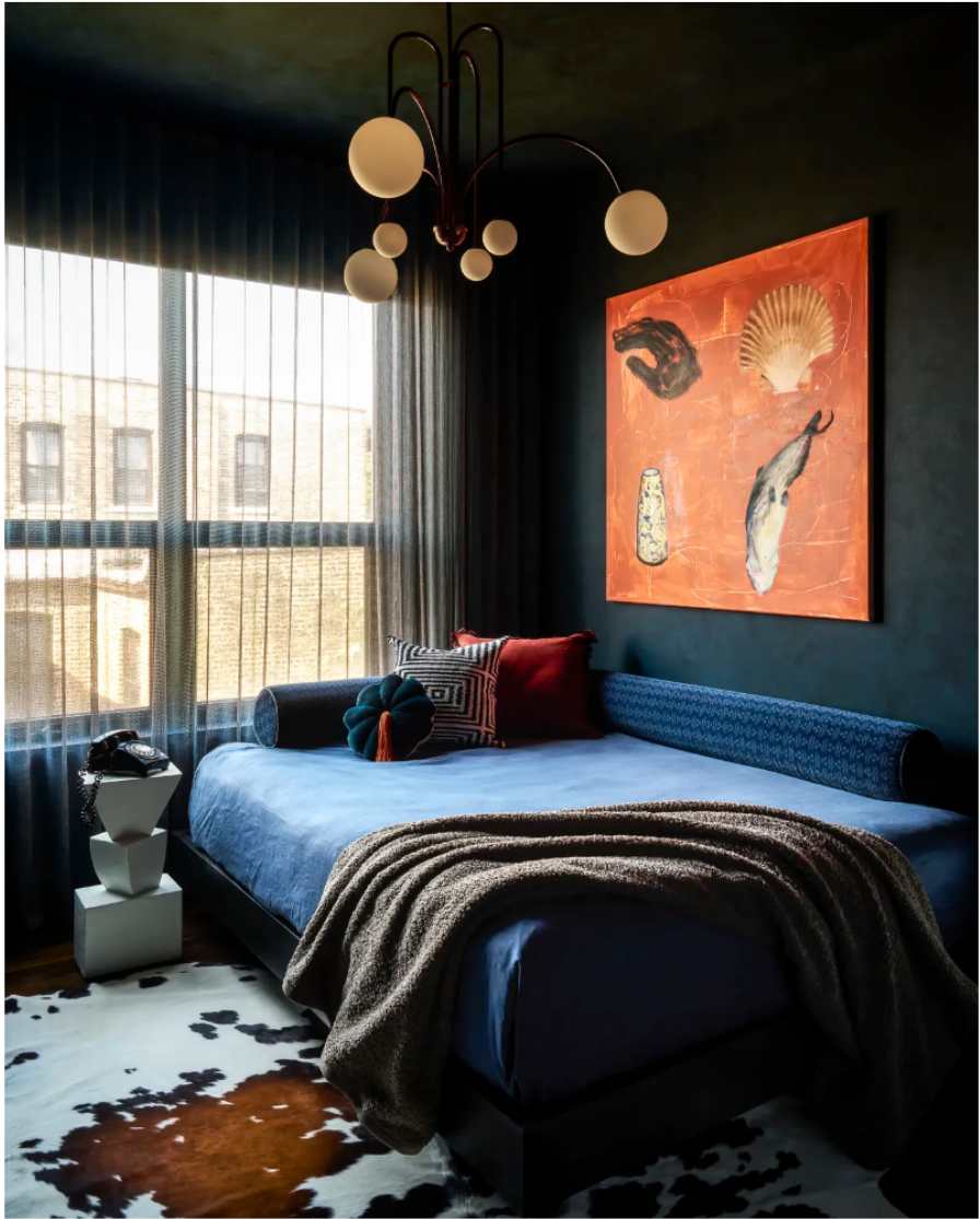
The guest room after the renovation (Image credit: Photography Credit: Ryan McDonald / Stylist Credit: Kimberly Swedelius)