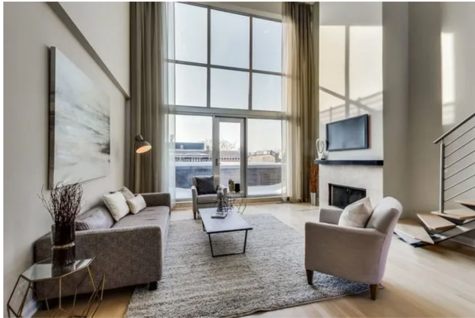
The living room before the renovation