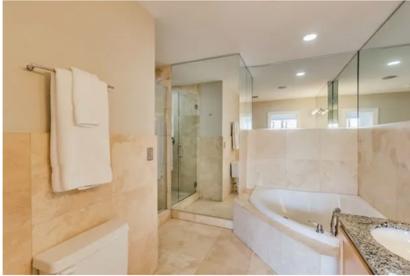
The bathroom before the renovation

Once you peek at the master bathroom post its renovation, you'll understand just how intelligent use of modern interior design can truly make or break a space. Looking at the refreshed bathroom, we can't help but admire the elements of decor that converted it into a virtually unrecognizable space. The bland white marble and aged layout is now a zen bathroom reminiscent of the kind that is usually spotted in spas and resorts.