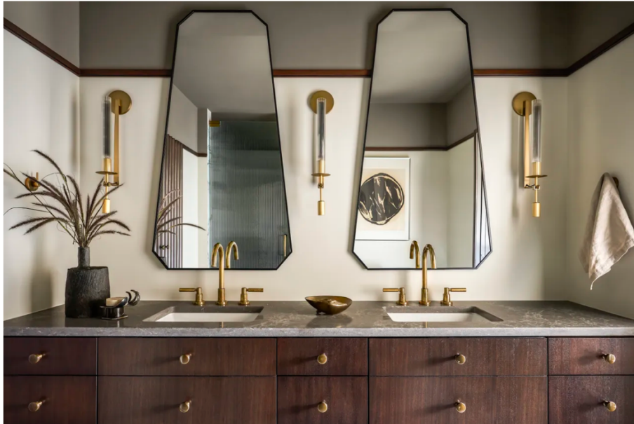
The bathroom after the renovation

Compared to what the modern bathroom once looked like, the new blueprint adds a dynamic dimension to the space. 'The original design was centered around a giant corner jacuzzi tub, a deep alcove for the shower, and a wall-to-wall mirror, making for very little functional counter space or storage. We worked through the layout in hopes of a simplified functional design, while allowing for moments of the unexpected,' she says.