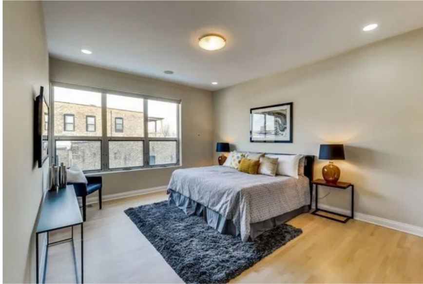
The master bedroom before the renovation

The modern bedroom receives heaps of light, so the hues of black and white add a refreshing contrast to the space. According to Lauren, her client was happily involved in the entirety of the renovation but understandably collaborated with them further to bring his vision of the ultimate bedroom to life.