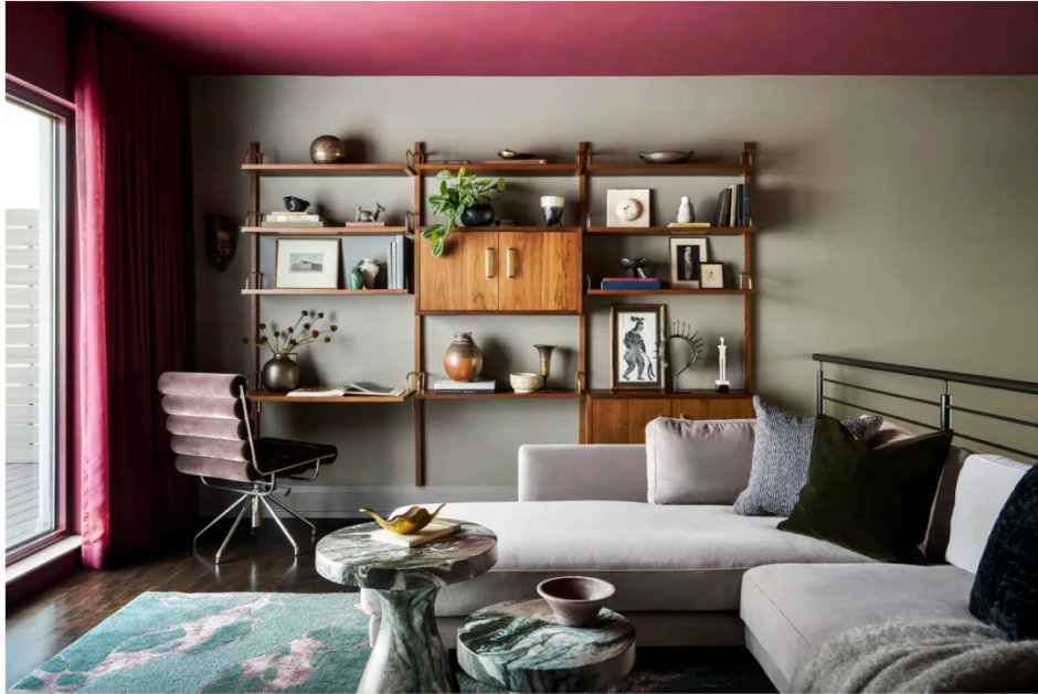
The study after the renovation

(Image credit: Photography Credit: Ryan McDonald / Stylist Credit: Kimberly Swedelius)