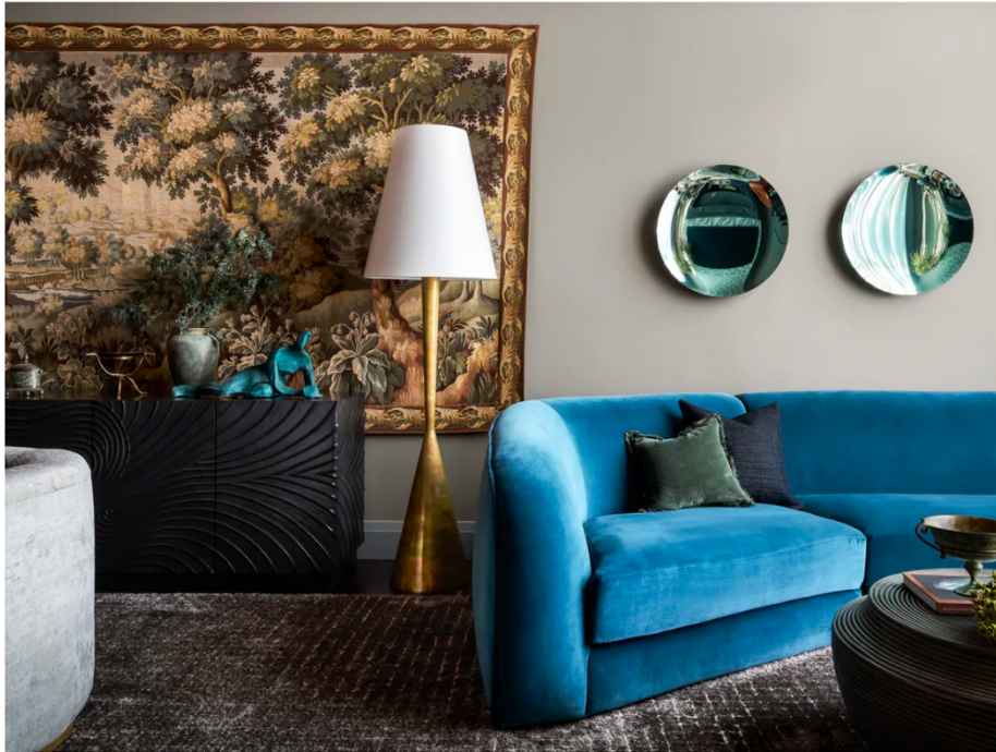
The living room after the renovation

(Image credit: Photography Credit: Ryan McDonald / Stylist Credit: Kimberly Swedelius)