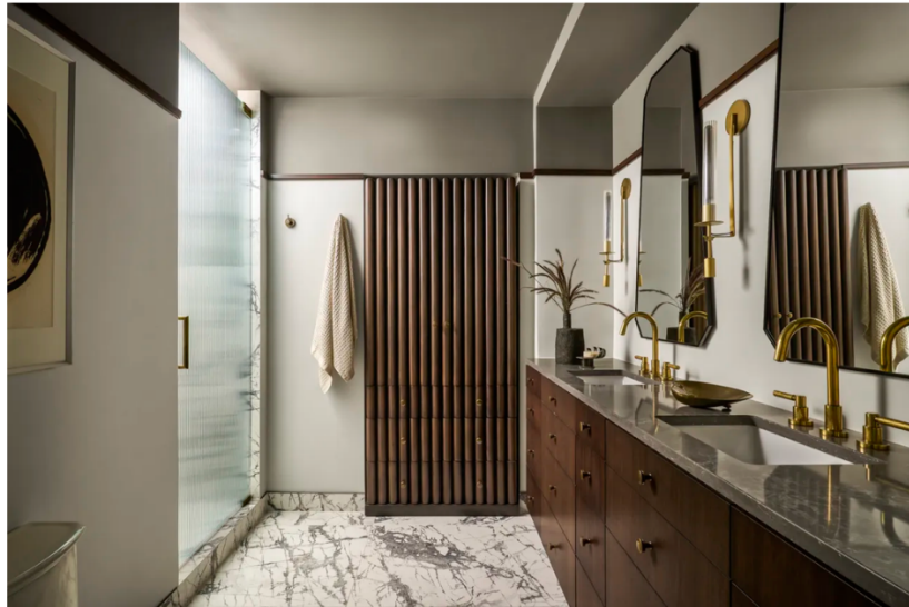
The bathroom after the renovation

Once you peek at the master bathroom post its renovation, you'll understand just how intelligent use of modern interior design can truly make or break a space. Looking at the refreshed bathroom, we can't help but admire the elements of decor that converted it into a virtually unrecognizable space. The bland white marble and aged layout is now a zen bathroom reminiscent of the kind that is usually spotted in spas and resorts.